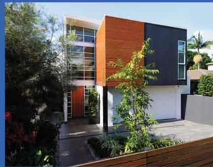
High Quality Finish

RMAX Orange Board® provides an exceptionally high quality finish that will accept all recognised render products. It is also an ideal surface for most styles of painting and decorative rendering techniques.