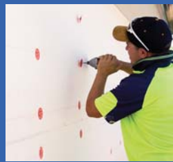
...quick to fix