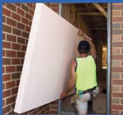
...light to lift

RMAX Orange Board® provides an exceptionally high quality finish that will accept all recognised render products. It is also an ideal surface for most styles of painting and decorative rendering techniques.