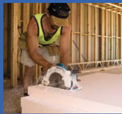
...easy to shape