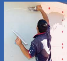
...perfect for render